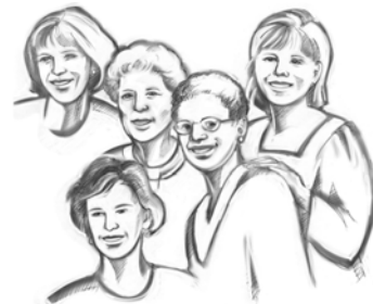
Women of the Church